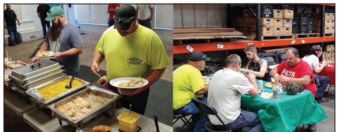
Franklin Bronze employees enjoyed a Christmas dinner — but it was held in July. The event from 2020 had been postponed due to the COVID-19 pandemic.